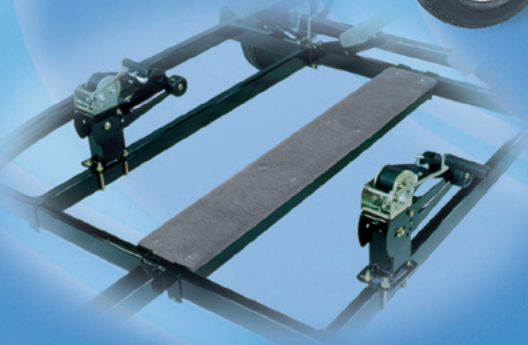
Optional center walkway

(Shown with optional storage box mounting kit and center walkway)