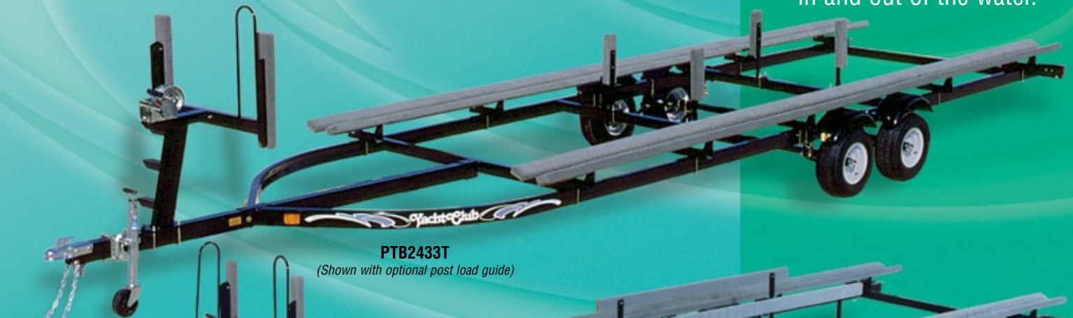
PTB2433T (Shown with optional post load guide)