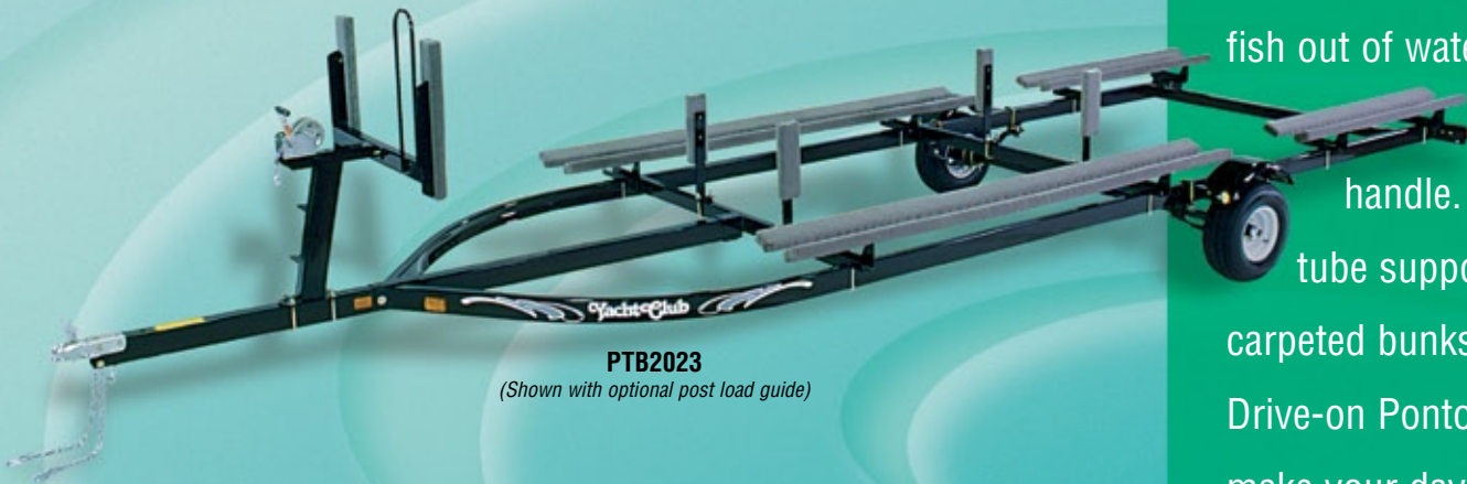
PTB2023 (Shown with optional post load guide)

A pontoon on a trailer is a big fish out of water ... and can be as tricky to handle. With maximum tube support and soft carpeted bunks, Yacht Club Drive-on Pontoon Trailers make your day go smoothly – in and out of the water.